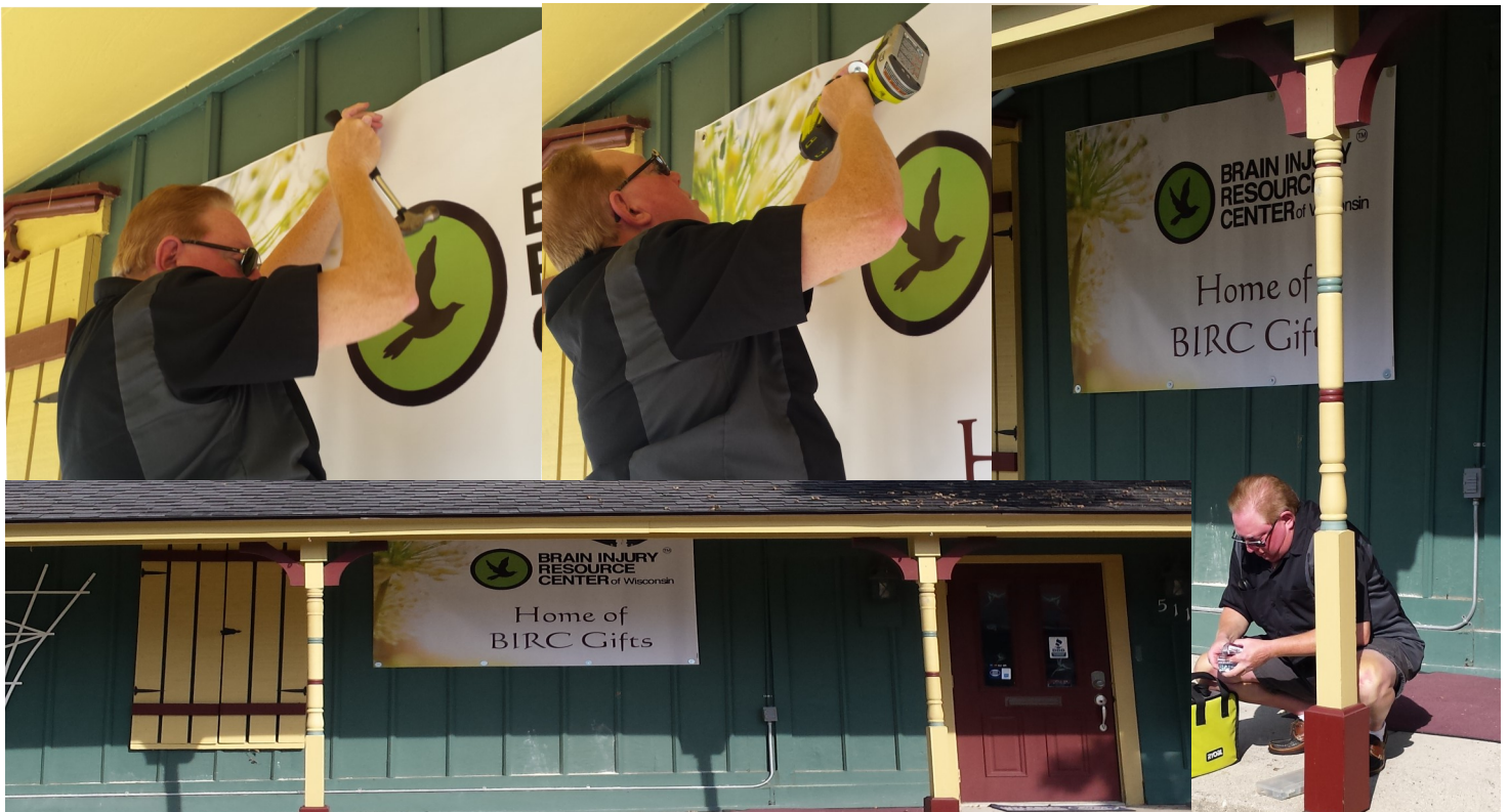
York-Lewis, L. (Photograph). (2017, 09). BIRCOFWI Front Sign. Waukesha, WI. Brain Injury Resource Center of Wisconsin, Inc.